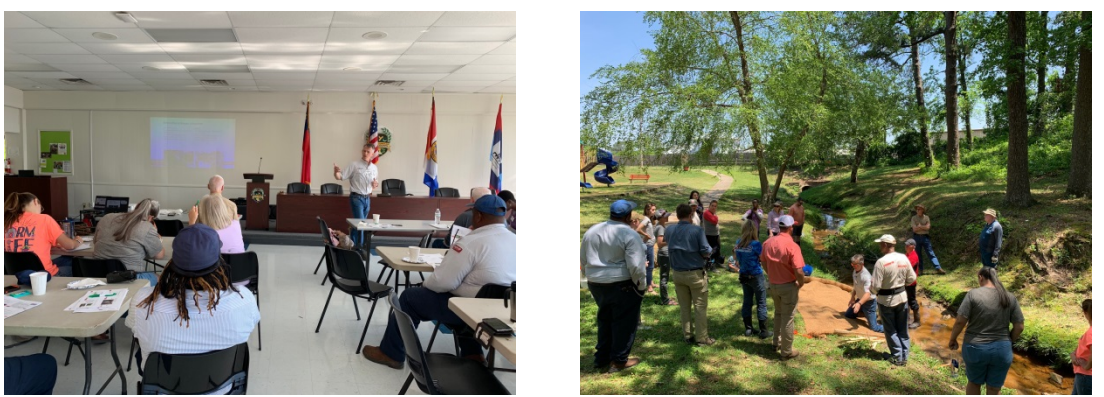
Photographs 7-8: Backyard Stream Repair Class

The Stormwater Program continues to maintain educational signs along the Cape Fear River Trail. In total, there are four signs that educate citizens about Stormwater, the importance of wetlands, and how the habitats surrounding the Cape Fear River benefit the City.