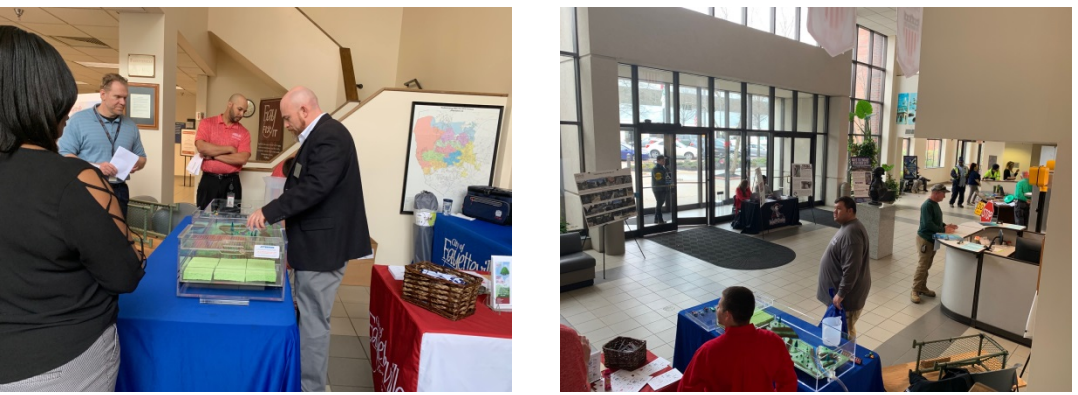
Photographs 5-6: Engineering Day

For each event, the Stormwater Educator and Stormwater Staff have provided information that is relevant for the event and has provided activities that would engage the participants. The Stormwater Educator has utilized several activities and tools mentioned above to provide public awareness about stormwater pollution prevention and the City's response to it. Following are several photographs from various public awareness events.