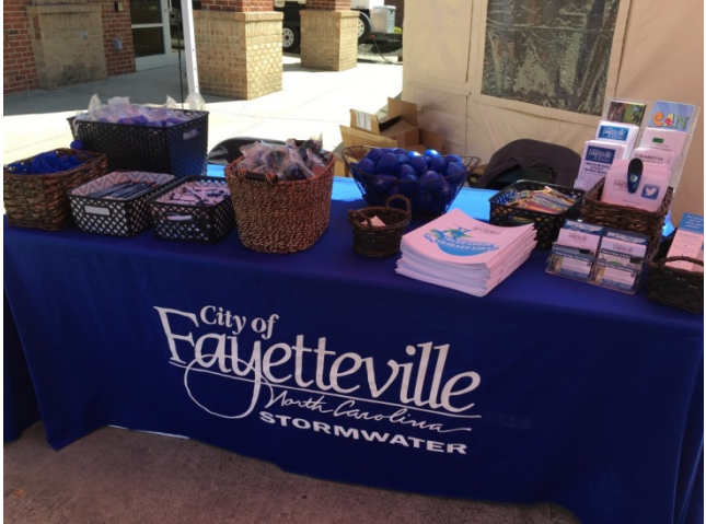
Photograph 4: Dogwood Festival Booth

For each event, the Stormwater Educator and Stormwater Staff have provided information that is relevant for the event and has provided activities that would engage the participants. The Stormwater Educator has utilized several activities and tools mentioned above to provide public awareness about stormwater pollution prevention and the City's response to it. Following are several photographs from various public awareness events.