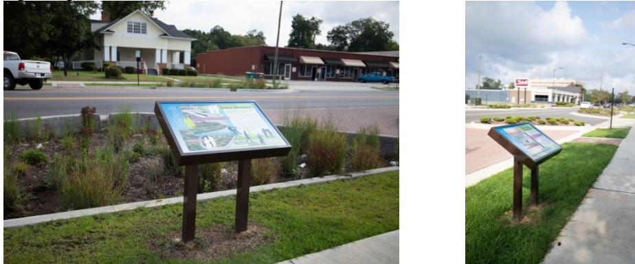
Photographs 11 & 12: Person Street Educational Signs

The City continues to maintain the educational signs that describe the stormwater control measures along the greenstreet.