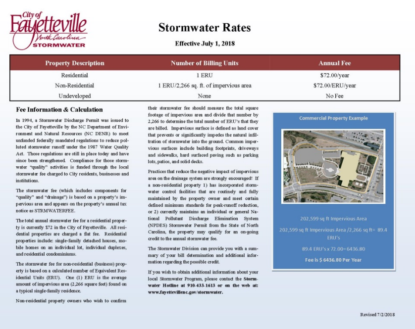
Photograph 1: Stormwater Fee Brochure