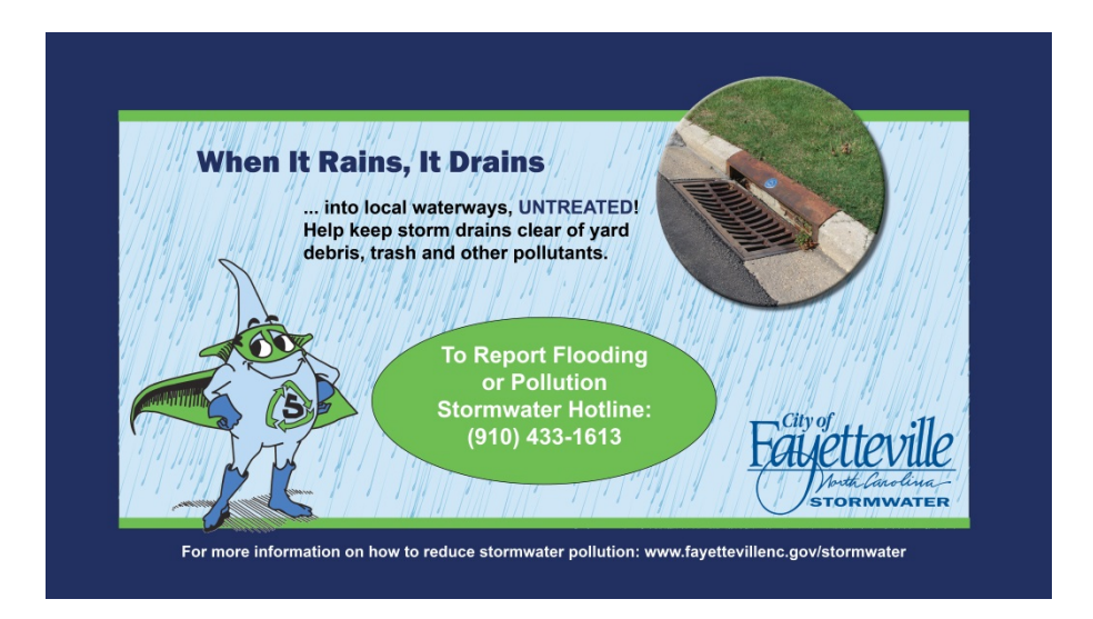
Photograph 2: Fayetteville TV Still Example