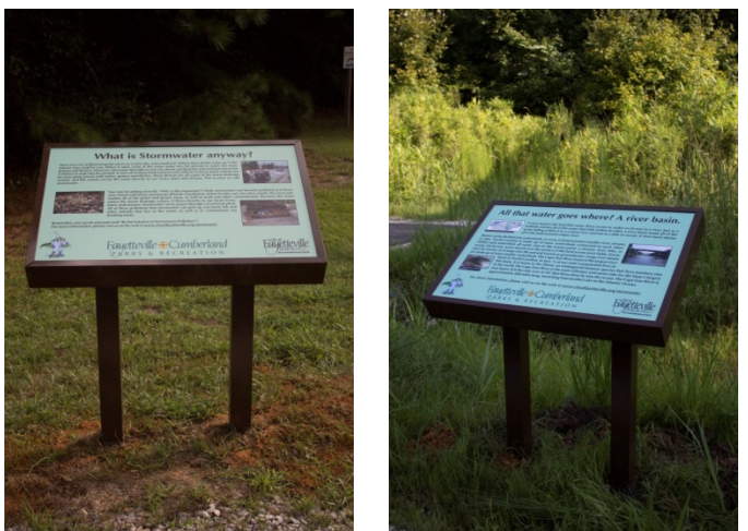
Photographs 9 & 10: Educational Signs on Cape Fear River Trail

The Stormwater Program continues to maintain educational signs along the Cape Fear River Trail. In total, there are four signs that educate citizens about Stormwater, the importance of wetlands, and how the habitats surrounding the Cape Fear River benefit the City.